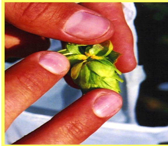
Foothill Hop Farm

Hops 101 and 201-Saturday-Sunday, October 9 and 10, 2010